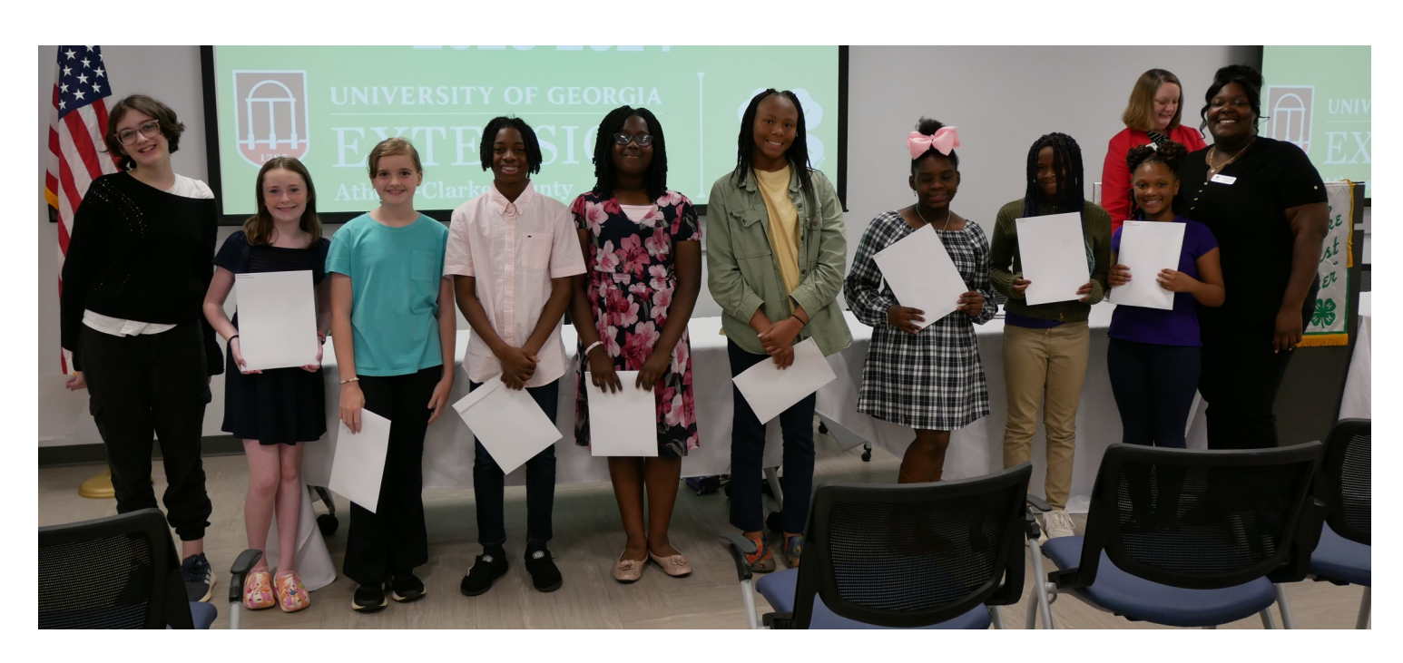
Cloverleaf DPA Participants ACC 4-H Awards Program on April 25, each student was recognized for outstanding work in their project area.