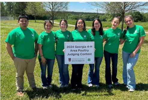
Elbert County Poultry Judging Team